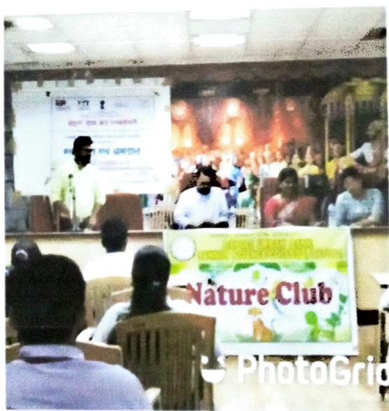
Nature club and Nehru yuva Kendra jointly organised cleanliness drive at Panchayat Samiti Dapoli