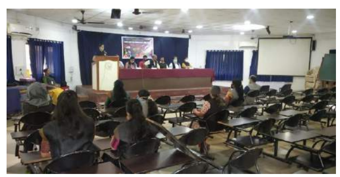
Offline Inauguration programme at seminar hall.