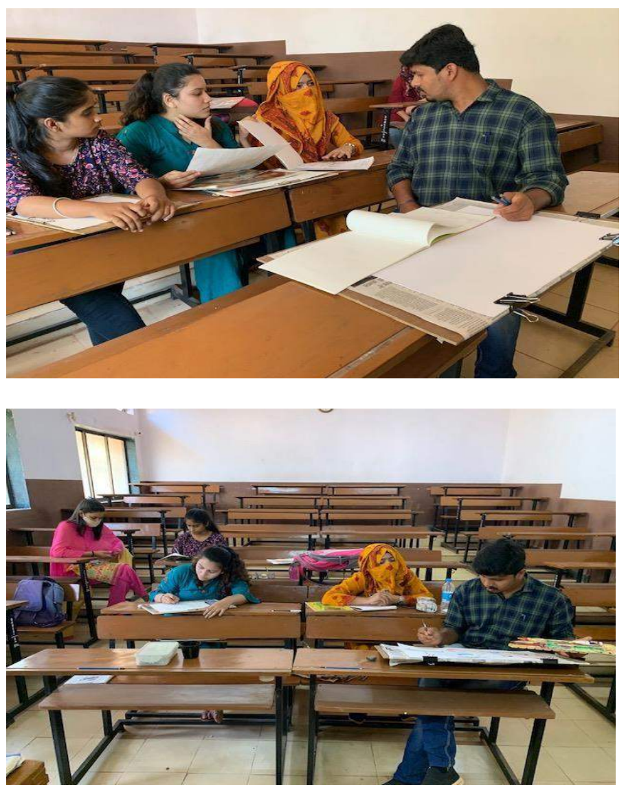
Offline fine arts workshop