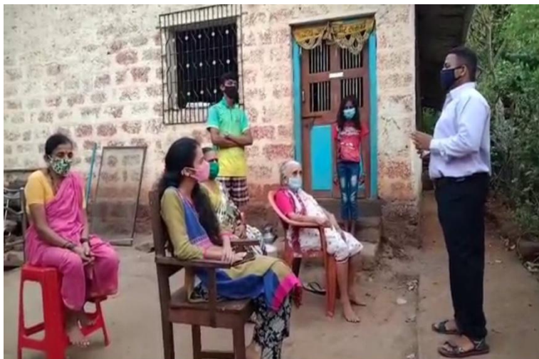
Students of PEC project giving information about Covid -19