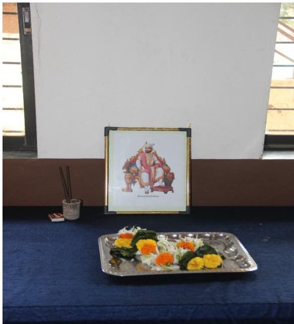
Celebration of Chhtrapati Shivaji maharaja jayanti

Feedback:- The overall programme is successfully conducted .