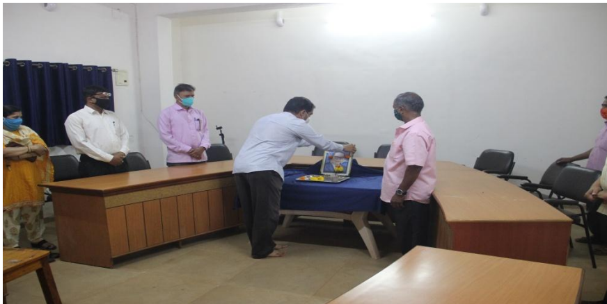
Celebration of Dr. BABASAHEB AMBEDKAR JAYANTI

Feedback:- The overall programme is successfully conducted though there is bad situation of Corona virus.