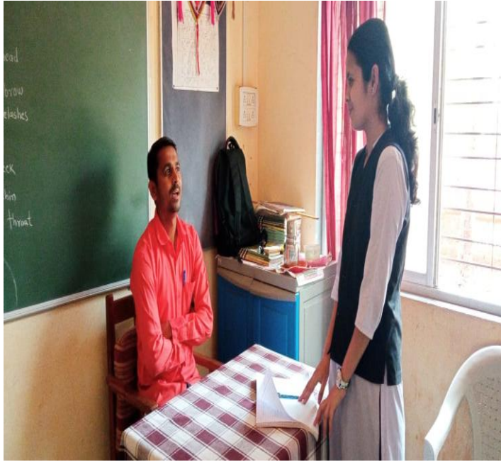
Interview of school teacher