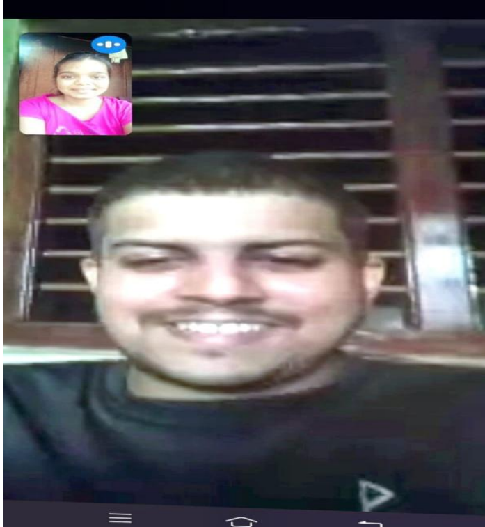
Online Interview of legal person