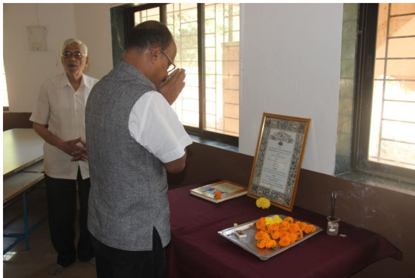
Celebration of Constitution Day. 26 th Nov. 2020