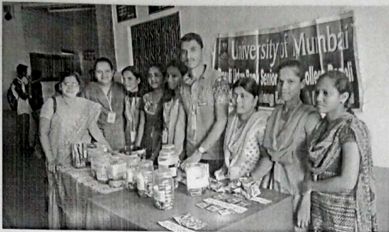
Chocolate stall of APY students on Chocolate Day

Identified the problems of the school and prepared the skit and posters on that.