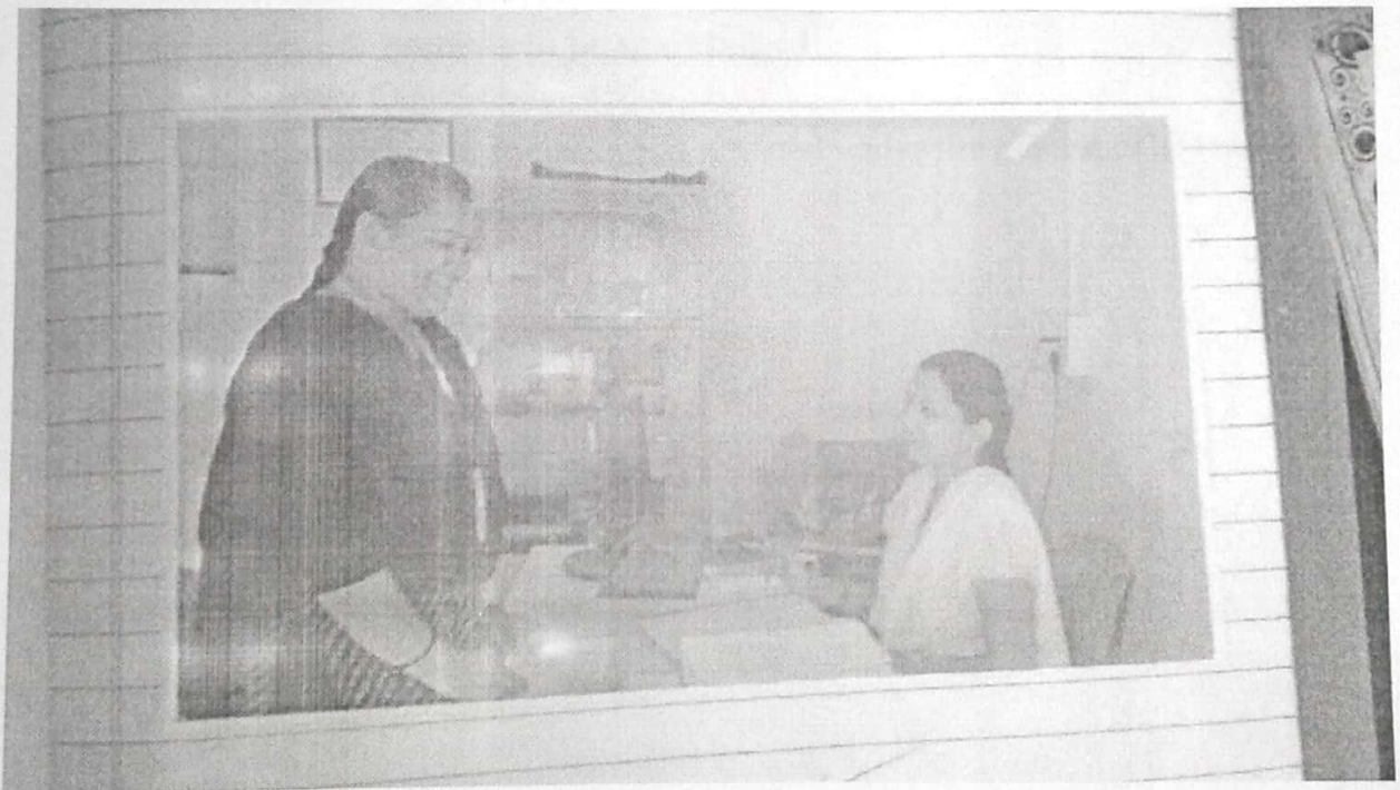
The students of CP projects taking interview about the carrier Law