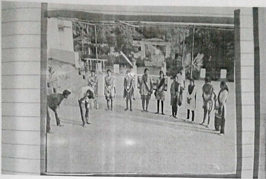
Street play of "Pradushan" of PEP projects student at Gimhavaneshool