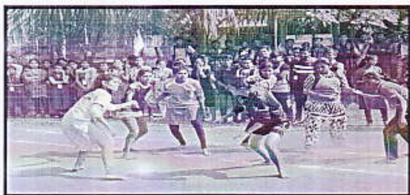
In annual sports F.Y.BSC girls VS S.Y.BSC girl kabaddisemi final match movement.