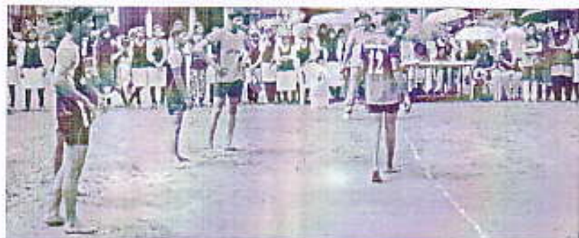
Kabbadi match Final FYBScVsSYBSc 2016-17