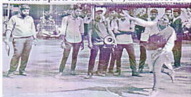
Shot put competition ( W) 2016-17