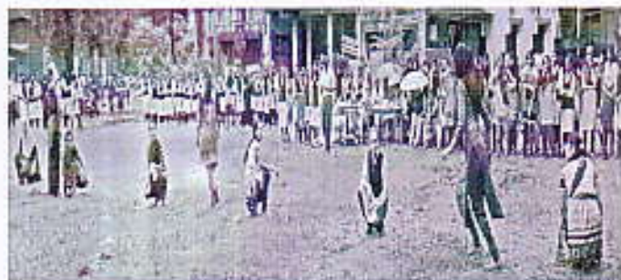
Manson Sports-Kho-Kho (W) match 2016-17