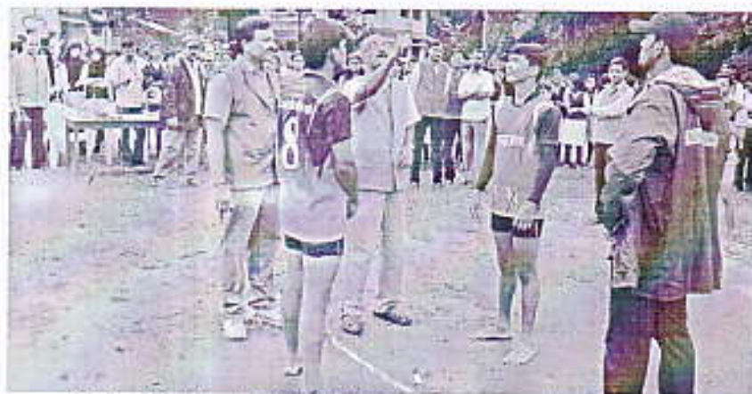
Kabaddi Match FYBScVsSYBSc : Toss by the hands