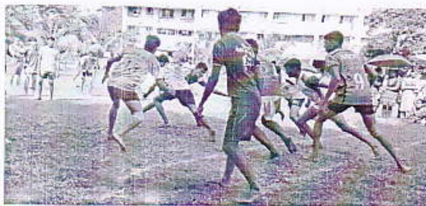
Manson Sports- Kabaddi match (M): F. Y. BSc. Vs. F. Y. B.Com