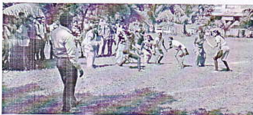
Manson Sports- Kabaddi match (W): F. Y. BSc. Vs. T. Y. B.Sc