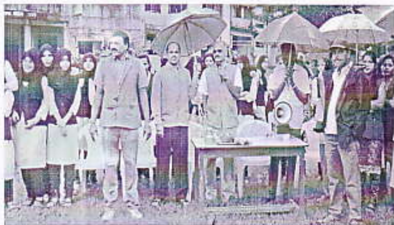
Inauguration of Monsoon sports 2016-17