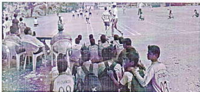
Dapoli Sports Club Dapoli and Sports dept., Dapoli Urban Bank Senior Science College, Dapoli Organized Sports for Students of Secondary schools of Dapoli Taluka.