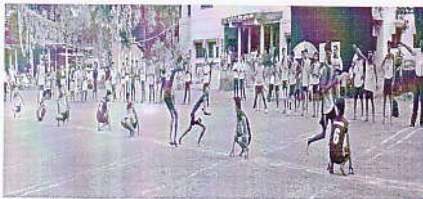
Intercollegiate Kho-Kho (M) competition Zone –V , organized by Sports dept. Dapoli Urban Bank Senior Science College Dapoli.