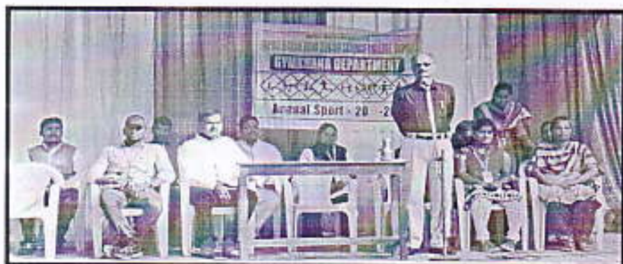
Annual Sports 2017-2018 opening ceremony movement.