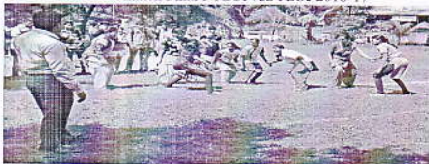
Kabaddi Match(W) SYBScVsFYBSc of Monsoon sports 2016-17